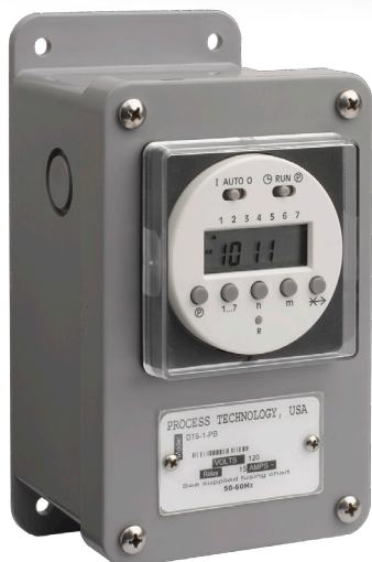
Pictured with optional plastic enclosure.