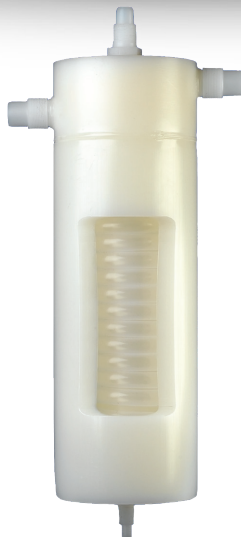
XC inline heat exchangers (cutaway for illustrative purposes).

Process Technology's rugged XC inline chemical heat exchangers are ideal for one-pass cooling of chemicals dumping to waste stream. This product is also appropriate for heating applications. The system innovatively eliminates high costs associated with water aspiration. Utilizing polypropylene or PVDF housing and fluoropolymer tubing, XC is configured for your application with custom sizes and configurations available.